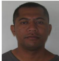
43. Das Tangatapoto