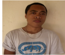
3. Tangata Taripo